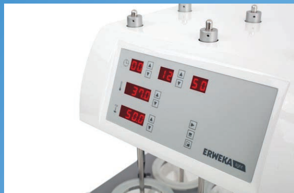
LED display and symbol keypad for easy control