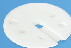
Low-evaporation vessel covers are included